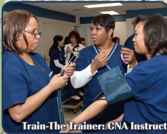
Train-The Trainer: CNA Instructor Course for Registered Nurses

Non-Credit Classes beginning January 9 th and later